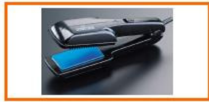
RONCO Flathair model 990

Equipment/Materials: The equipment used in the experiment were the RONCO Flathair, model 990, Poodle Perfect hair gel, and a 2 year-old Standard Poodle.